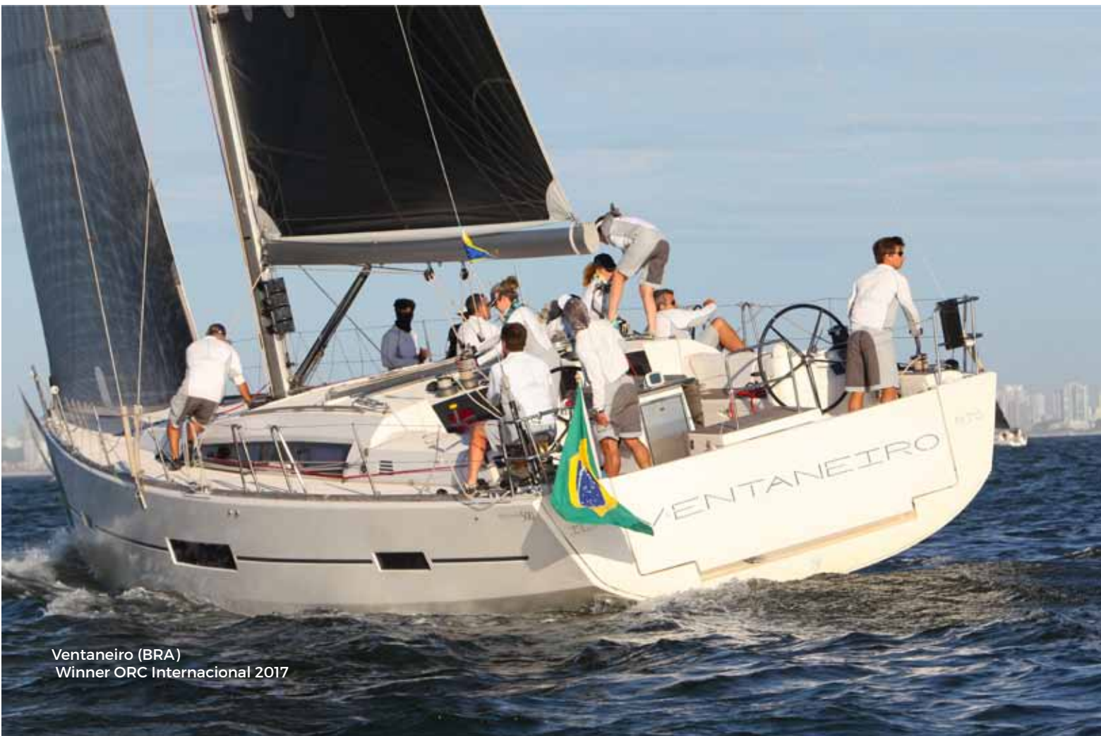
Ventaneiro (BRA) Winner ORC Internacional 2017