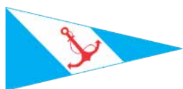
YACHT CLUB ARGENTINO

In commemoration of the Centenary of the Iate Clube do Río de Janeiro.