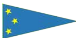
IATE CLUBE DO RIO DE JANEIRO