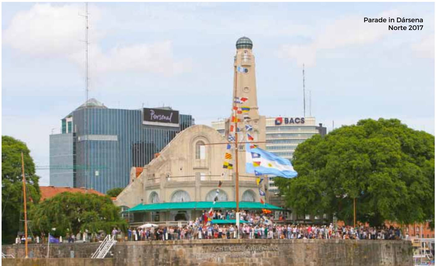
Parade in Dársena Norte 2017

In commemoration of the Centenary of the late Clube do Rio de Janeiro.