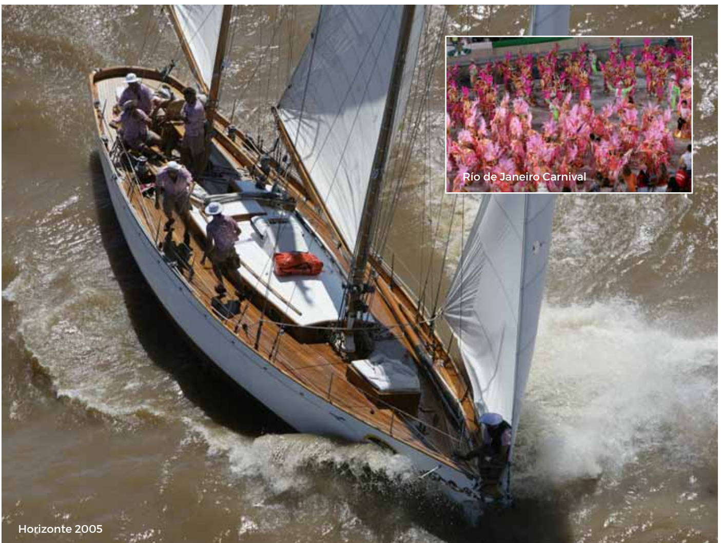
Rio de Janeiro Carnival