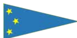
IATE CLUBE DO RIO DE JANEIRO