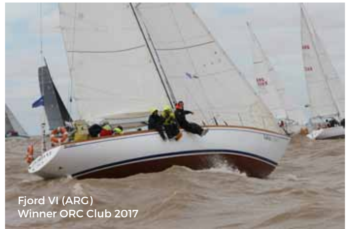
Fjord VI (ARG) Winner ORC Club 2017

E very three years the most experienced sailors come together again to challenge the ocean and travel those 1200 miles, writing new pages of nautical history. You can be a part of this legend. Do not miss the 2020 edition, where we will also celebrate 100 years of late Clube Rio de Janeiro, making this a real party.