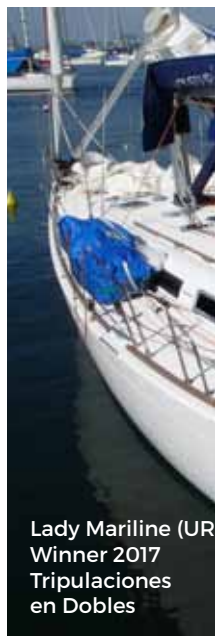
Lady Mariline (UR) Winner 2017 Tripulaciones en Dobles