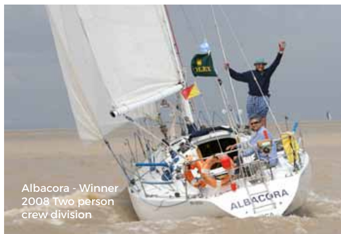
Albacora - Winner 2008 Two person crew division