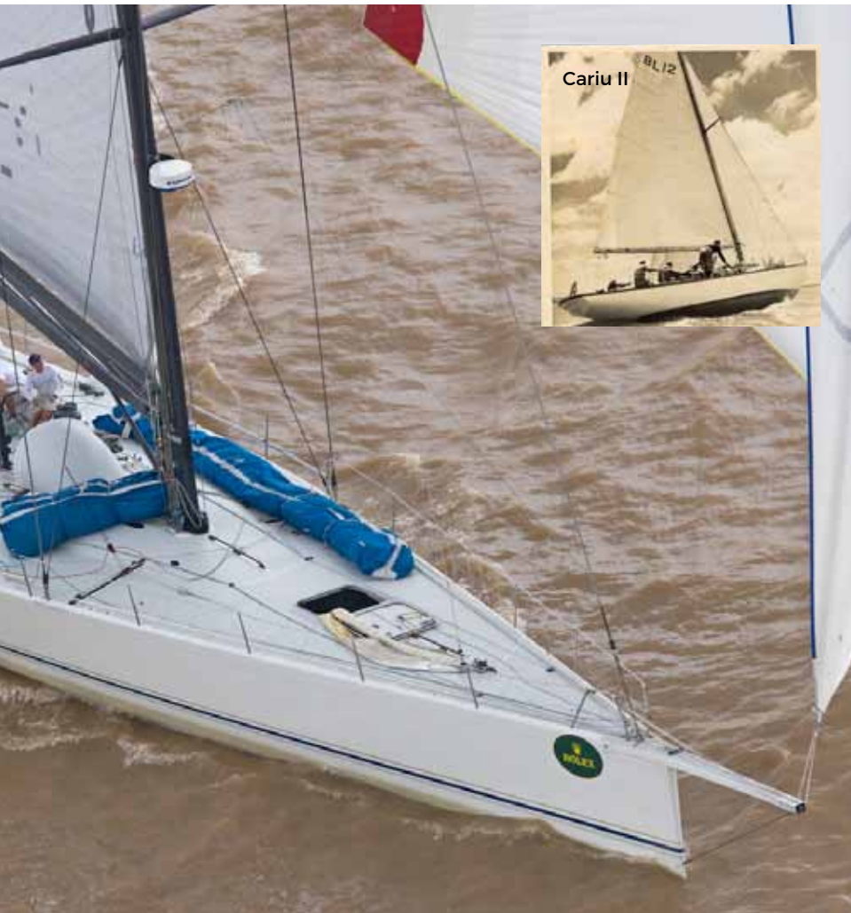
Cariu II BL12